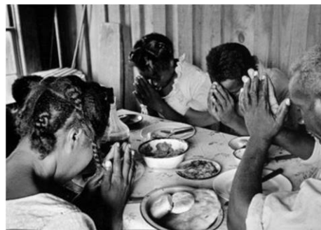
A Southern sharecropping family saying grace. Lack of proper nutrition was never a factor pre-War for slaves or Plain Folk of the Old South.

In addition to the social cost there was also a financial cost to moving large numbers of Southern families each year. As previously noted it has been estimated that the cost of sharecropper migration across the South as late as 1938 was $25,000,000 annually and of course this cost had to be paid by individual sharecropping families. Under chattel slavery the cost of moving (which happened rarely) was paid by the plantation owner—but under sharecropping slavery the cost was born by black and white sharecroppers. This is yet again another example of how the system of sharecropping slavery prevented the accumulation of capital by millions of white and black Southern farmers. It represents millions of dollars that were wasted—not saved and invested but wasted in order for the family to merely survive in this “one nation with liberty and justice for all.” Of course “liberty and justice for all” excludes people of the defeated and occupied Confederate States of America.