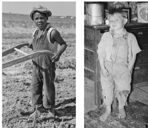
Black and white sharecropper children circa 1938

Do these young Southerners have more in common with each other or with the ruling elite in Washington, D.C and crony capitalists on Wall St.? Who benefits from the racial divide created post War?